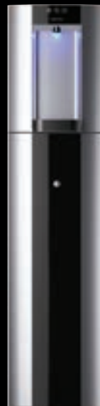
Silver - Floorstanding