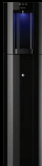
Black - Floorstanding