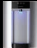
Silver - Countertop