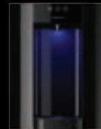
Black - Countertop